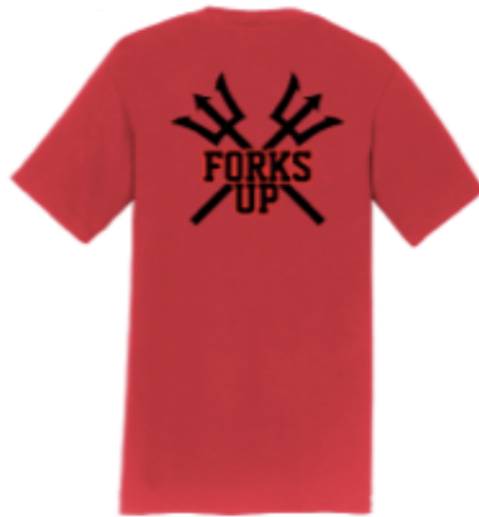
RED TEE $25 Adult sizes S-XXL